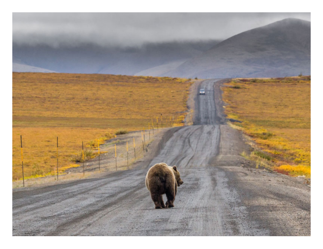
Yukon & the Dempster Highway Road Trip