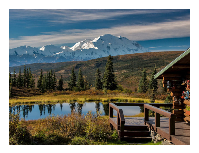
Denali Backcountry Lodge Explorer