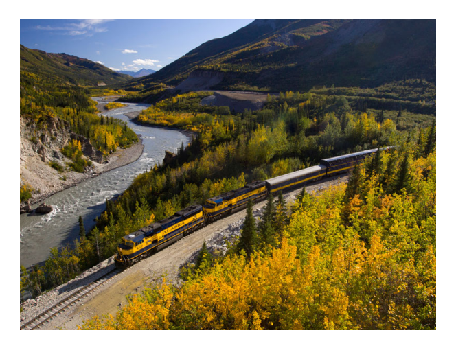
Alaska Train Vacation Kenai Road Trip Combo